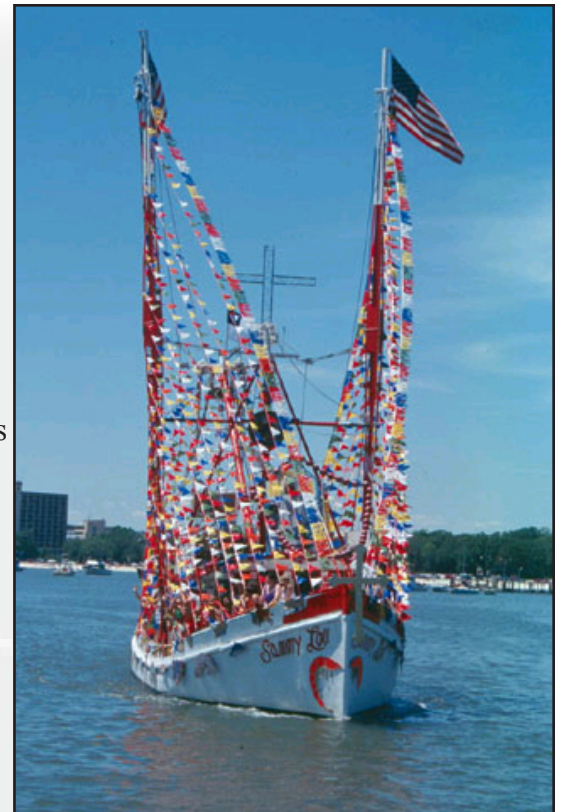
Community Traditions: The Blessing of the Fleet Boat Ceremony, Biloxi Shrimp trawler Sammy Lou approaches the blessing boat. *