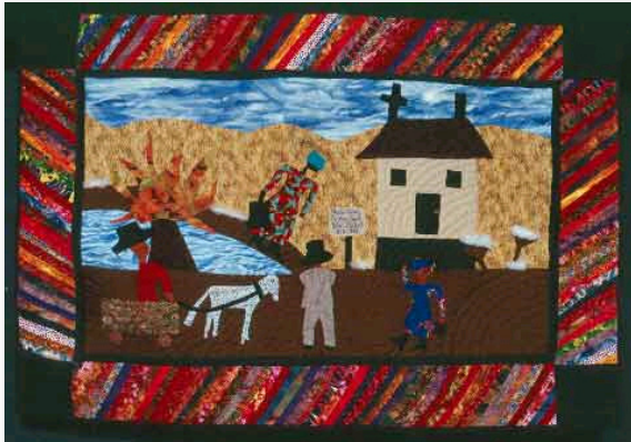
“Mundal Grove Church.” This quilt depicts when the church was first organized in Port Gibson, between 1868 and 1887. The quilt was made as part of the Port Gibson Bicentennial Art Project in 2003.