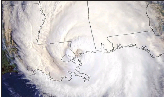
Satellite view of Hurricane Katrina as the storm's eye passes over Pearlington, Waveland, Bay St. Louis and Pass Christian, Mississippi on August 29, 2005.