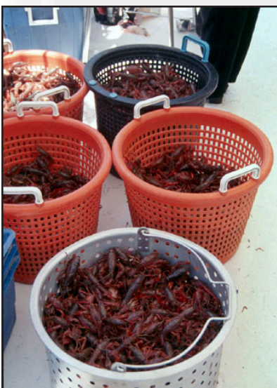
Crawfish ready to be boiled on the deck of Lady of the Sea Boat1. *