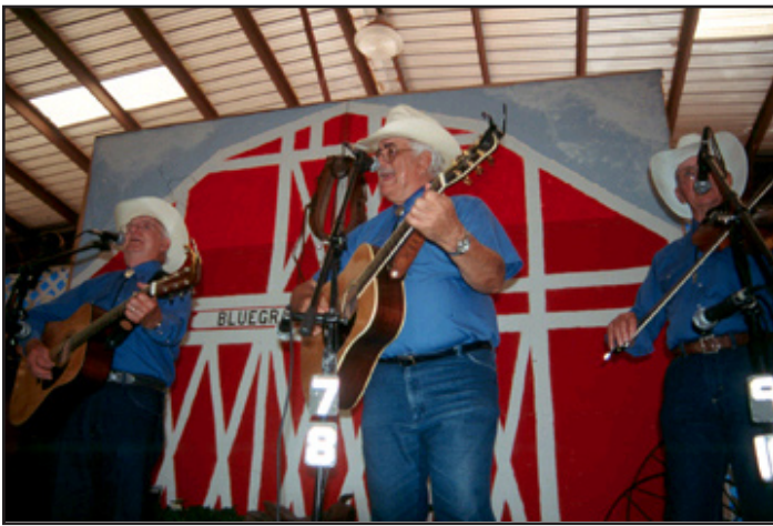
Driskill Mountain Bluegrass Band (Bay St. Louis) performing at the Bluegrass on the Creek Festival, Tylertown, May 2005. *

Swift. Jessica Simpson. Queen Latifah. LeeAnn Rimes. The National Governor’s Association Conference (with the possibility that Sarah Palin would attend). By bringing in some of the brightest stars, both of the entertainment and political worlds, is a creative economy for Mississippi, albeit an unintentional one—much like following the events of Katrina. MAC has demonstrated its ability to get Mississippi back to its strengths, and we should return to this place again.